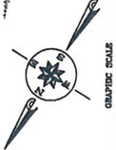
Exhibit "B-Site Plan"

FREEPORT CENTER ASSOCIATES JANUARY 2005 DRAWN BY: DALE V. TELERIO